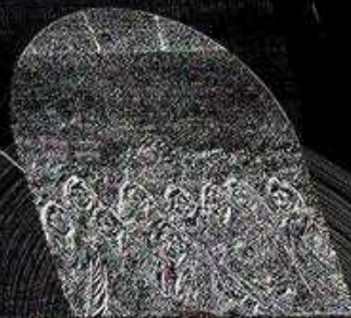
The very first meeting for the Kapa Omega Colony

January 1st was Omega's Day, celebrating 100 years since the first Kapa Omega Colony was founded in 2018. The first meeting consisted of just 10 girls out of the foundation of our amazing organization. Since then our chapter has grown tremendously, expanding to currently consisting of majors in 2020 and just 27 actives to over 36 majors, 14 actives and 50 alumnae currently in 2023. We love how much we've grown and can't wait to see how else we expand in the future.