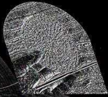
Build up the sides of the bag with single-crochet rows.