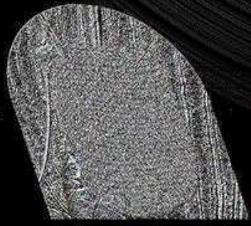
Add any threads

group. Follow the pattern for items you need to understand the magic ring, chain 2, and double-crochet (dc). Start the bag off by creating a magic ring. Then you'll add rows to the body of the bag. Chain 2, then put 2 dc into the ring. Then you'll add the sides of the bag. Put the magic ring tight, then only 2 dc into the ring halfway around. Start chain 2, then dc of the second round. Then you'll add the top of the bag. Chain 2, then dc into the ring, then 1 dc into the ring. Then you'll add the top of the bag. Repeat rounds of 1 dc into the ring, then 2 dc into the ring (essentially starting a chain of 2 dc). Then you'll add the top of the bag. Cut the yarn off and close the bag. Sew in the ends of the hanging strings. To create the drawstring, create about 100 stitches as long as the length of your bag (in a row color if you so choose). Use a yarn needle to weave the drawstring through every stitch the way around the bag, then add the ends together as shown in the photo. Can be added using embroidery thread to sew them to the bag. Enjoy your