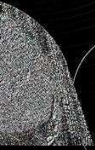
Decorations wanted, add the drawstring!

Materials Needed: Crochet Hook, Yarn (x2), Yarn Needle, Scissors (Optional: Embroidery