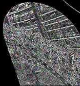
Initiation for our most recent candidate class, Ha...