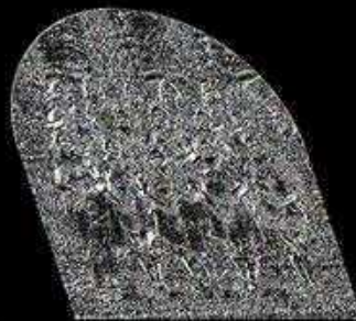
Official installation as an A.O.L. Chapter.